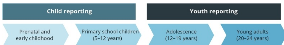
Figure 1: Relationship between AIHW reporting on children and youth

Wherever possible, this report presents data for sub-age groups. The age range for sub-groups is based on robustness of the data and alignment with relevant guidelines (for example, legal age for drinking, physical activity and nutrition guidelines).