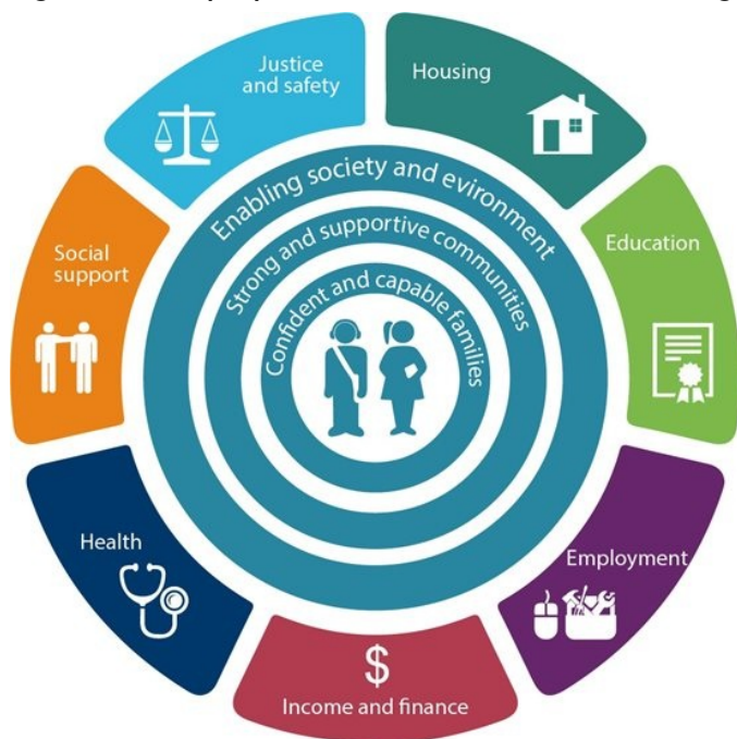
Figure 2: AIHW people-centred data model and an ecological approach to the wellbeing of young people

Currently, data are mostly available from separate and disconnected sources. This makes it difficult to undertake regular national reporting on many topics that cut across different domains-such as physical and mental health within the context of education or work, homelessness or unstable housing, or of young people in the justice system. Regular national reporting on such cross-cutting themes requires regular national multi-sectorial data linkage. For more information, see Data gaps .